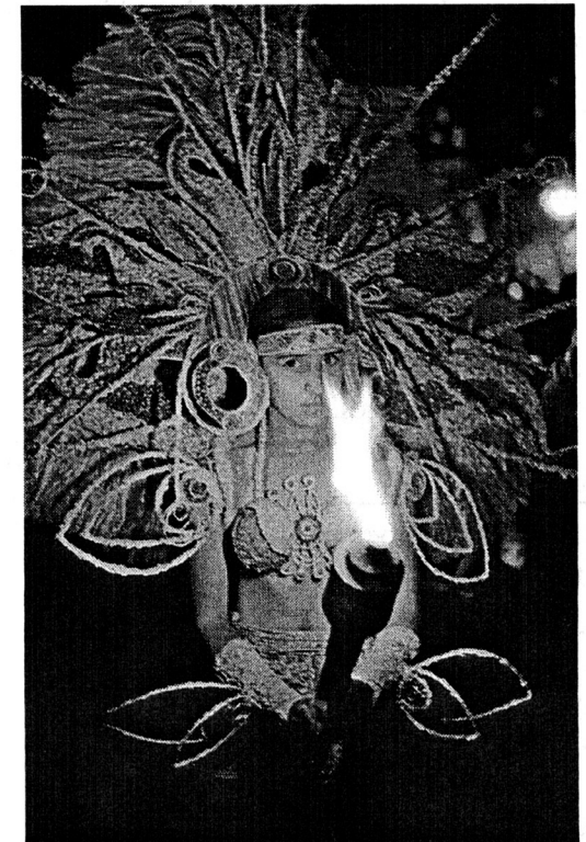
Taino Princess