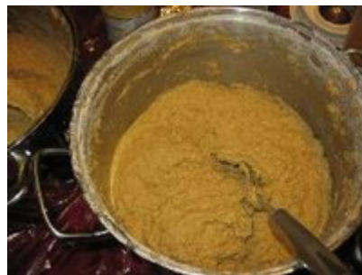
Cooking up the Masa for Pasteles.

To begin, it should be understood that Pasteles are indeed of indigenous origin. In fact, a type of pasteles – the “Mexican” tamale or tamalli in Nahuatl – can be traced back as early as 5000 BC.